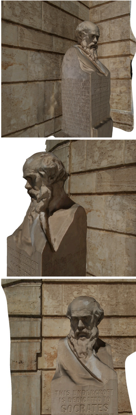
Figure 6: A full 3D reconstruction from 24 photographs.