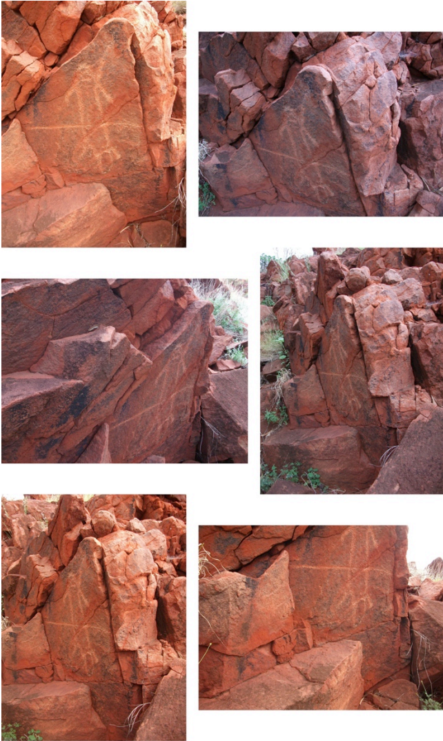
Figure 4: Six photographs of a rock art structure, approximately 3m across.

public image collections such as Flickr [17]. It should also be pointed out that these photographs are taken with a modest ten MPixel "point and click" camera. This example is also interesting given the rock surface textures are very noisy surfaces without clear distinguishing geometric or colour features. Views of the reconstructed surface are given in figure 5.