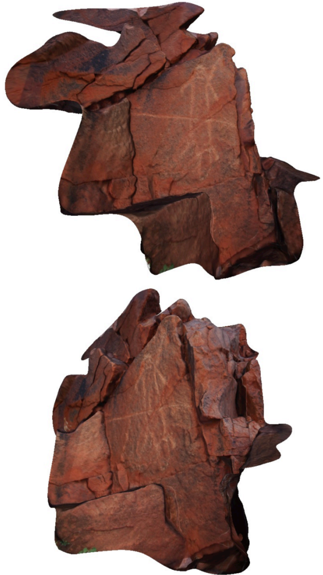
Figure 5: Two views of the reconstructed model from the six images in figure 4.

record and creating objects as research data the true geometric detail is more important.