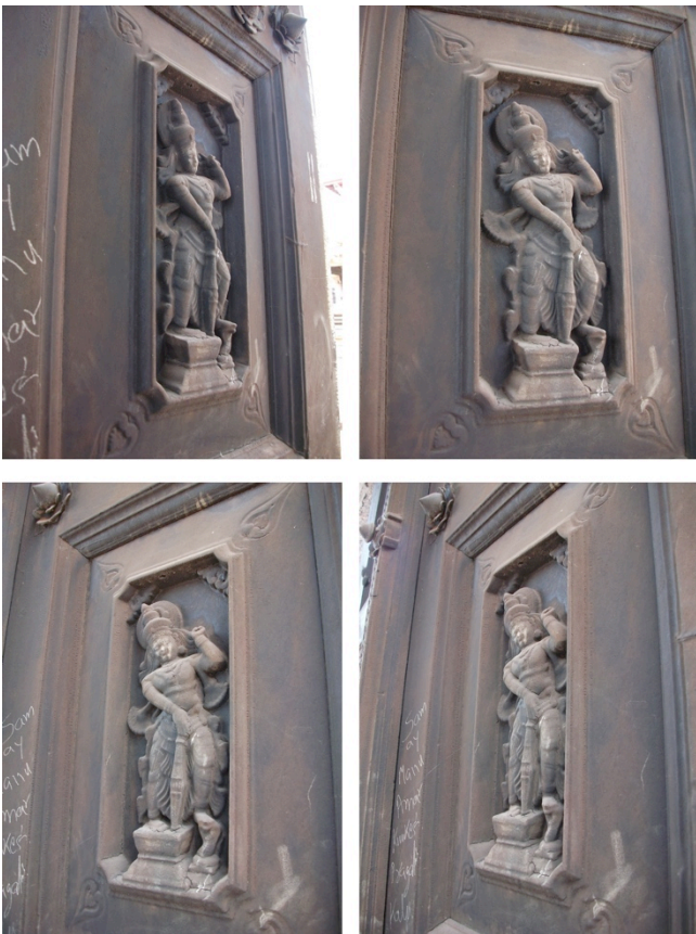
Figure 2: Four photographs of an embossed wall at the 1000 column temple, approximately 10cm across.

Note that the last two are based upon the open source tool Bundler. PhotoSynth and 123D Catch are both cloud based solutions, the results shown here are from either 123D Catch or PhotoModeller. The former is by far the simplest to use (almost no user control) at the price of potentially not providing the same quality results as PhotoModeller. This article is not intended to serve as an evaluation of these packages, in particular, they often have their own strengths and so the best choice can be application specific.