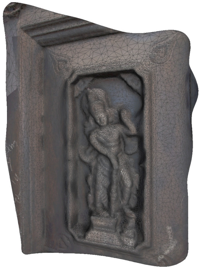
Figure 3: Reconstructed and textured mesh from the four images presented in figure 2.

Feature point extraction is the process of identifying equivalent points in each image, or at least between pairs of images in a sequence. This phase of the reconstruction pipeline is similar to the feature point extraction used in stitching panorama or gigapixel photographs. The use of special markers, required for an accurate result using some packages, is a means of ensuring high quality matched feature points. Of note in this example is the lack of strong colour information, often assumed to be required in the process of feature point extraction between the images.