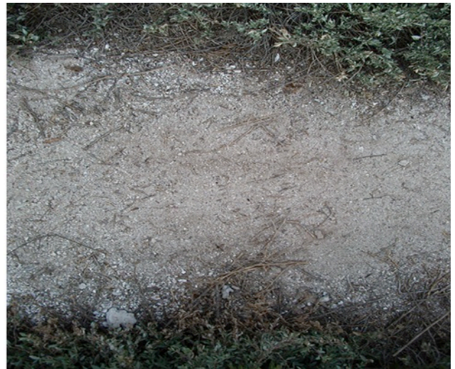
Figure 8. Images of coral and sands in order to create landscape textures.