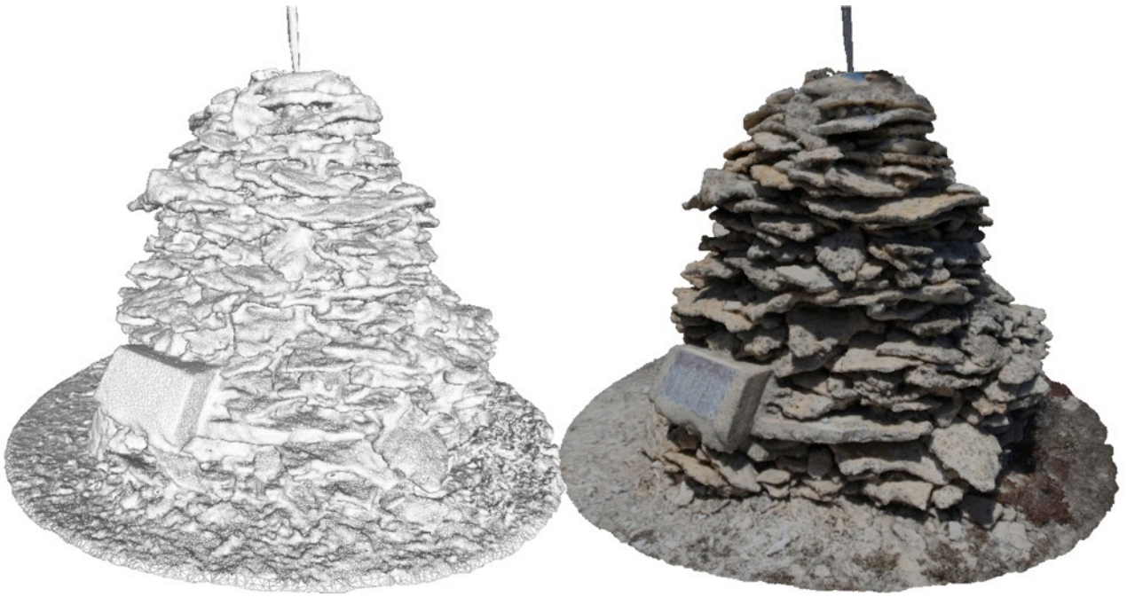
Figure 10. Reconstruction examples of the cairn, mesh on the left, textured mesh on the right.