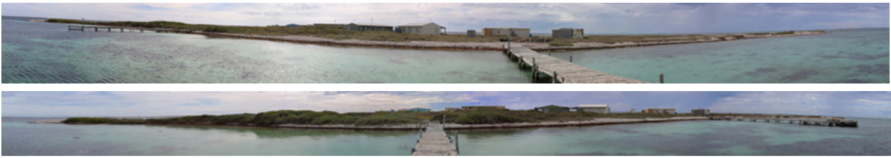
Figure 2. High resolution images from the other two jetties on the opposite side of the island. (2013)