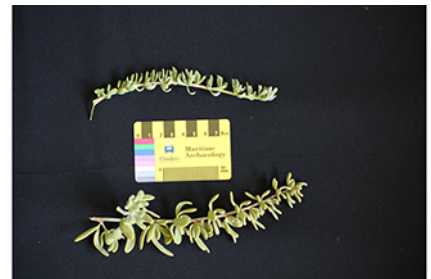
Figure 7. Photography of plant material in order to create believable virtual plants.