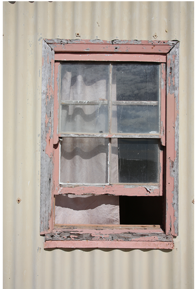
Figure 6. Example of orthographic capture of building features.