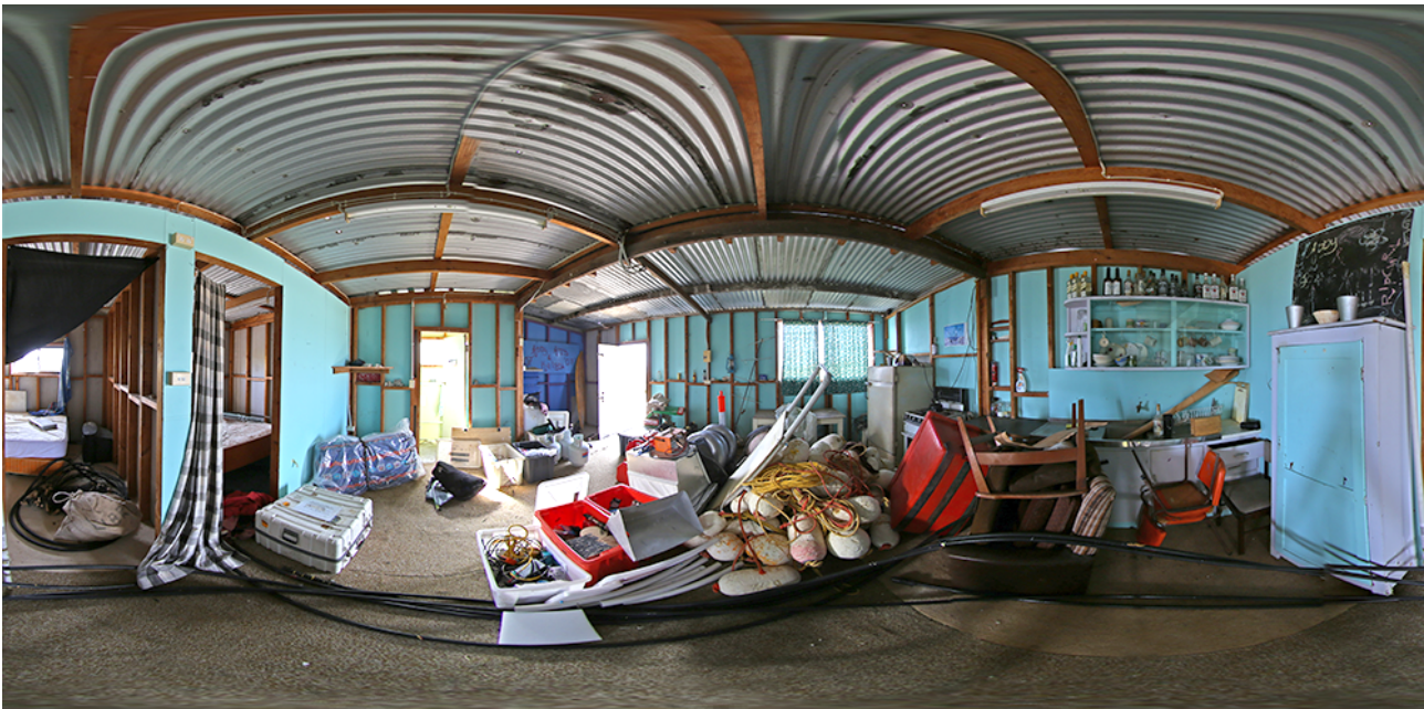
Figure 3. Center of room 2 on building 3. Every room in every building was photographed in this way.

In total there are now 40 external bubbles and over 100 bubbles from the rooms in the buildings.