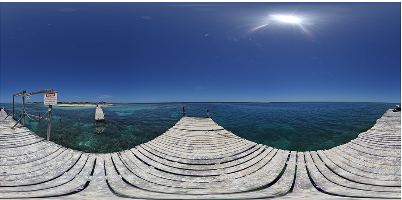
Figure 5. Bubbles from the main jetty after the mid section was damaged between the 2013 and 2014 trips. (2014)