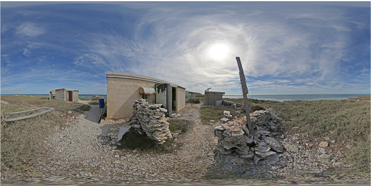
Figure 4. Example of an external bubble.